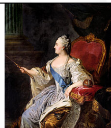
Catherine the Great