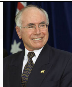
John Howard 25 th Prime Minister of Australia