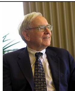
Warren Buffett American business magnate and investor

Common Frustration for Others: They may work too much.